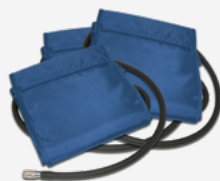
cuffs in size XS, S, M, L, XL

AMEDTEC Medizintechnik Aue GmbH Schneeberger Straße 5 · 08280 Aue · Germany Phone: +49 (0)3771 59 82 70 Fax: +49 (0)3771 59 82 790 info@amedtec.de · www.amedtec.de