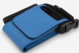
pouch for Holter-RR